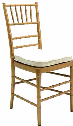
A002 Gold Chiavary Chair H92 x W40 x 40 cm.