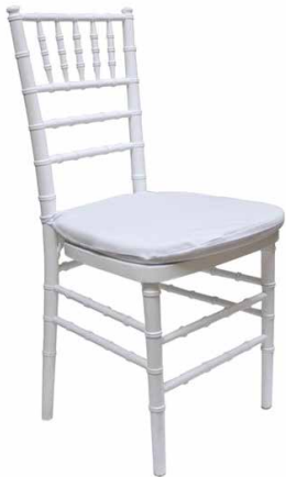
A001 White Chiavary Chair H92 x W40 x 40 cm.

An additional cost of THB 350 per chair will apply unless stated in package inclusions*