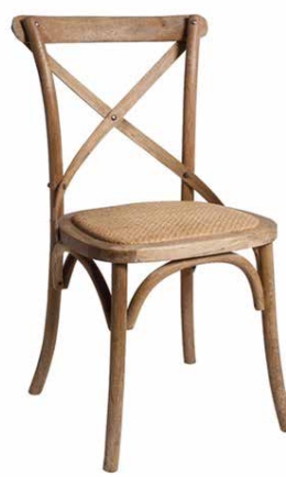
A003 Wooden Crossback Chair H92 x W42 x 42 cm.