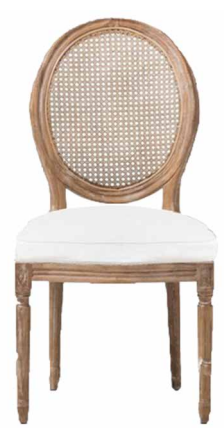
A004 Wooden Dior Chair H92 x W40 x 40 cm.